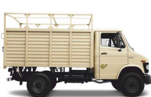
LARGER LOADING AREA